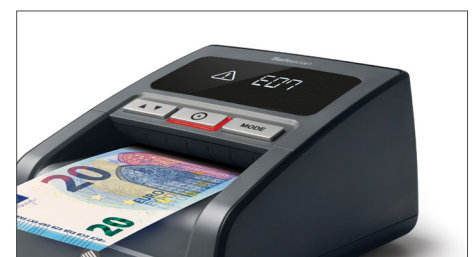
Counterfeit banknote alarm